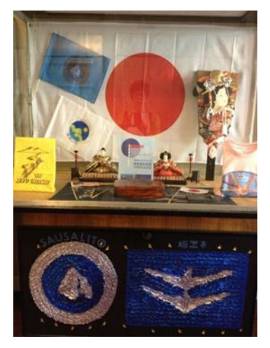
Display at Sausalito's City Hall to promote the Sister City's Program to citizens and city hall visitors

By Dina Hatchuel, Sausalito Sakaide Sister Cities (Edited for length)